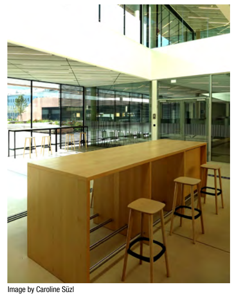
Therefore, it has been designed to be as quiet as possible. For example, the delineated work tables will reduce distractions from others. The new

collection of publications. It has a reading area and also offers a peaceful view from the windows. This is a quiet zone. Finally, the Focus Area provides library users with a space where they can concentrate and focus on their writing.