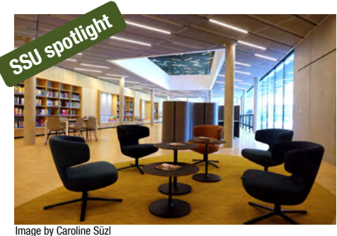
The new library

Further information on science education and events for children can be found on our science education webpage.